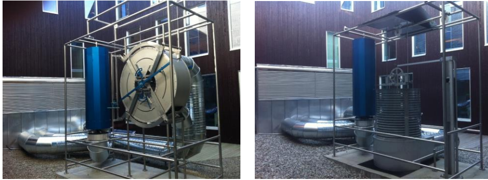
Figure 2A and 2B: 2A: Step two 'Pulse' real-size installation on site; first version. It was a failure because the air from the ventilation system did not move the hammer. Figure 2B: Step three: 'Pulse' real-size installation on site; second version, including a frictionless bellows, and where all functions were safeguarded and resolved according to the original concept.

necessary competence. It also meant that through this partnership, unexpected solutions to specific problems could emerge. It was a situation where the artist gave up some of the control in respect for others' expertise and professionalism. At this stage, therefore, based on the model, one of the main parts was interpreted as an impossible solution.