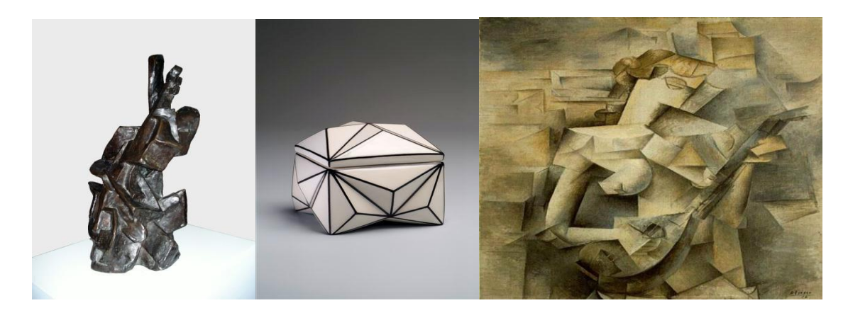
Figure 1. A B C A: Two view of the Large Horse (1914), by Raymond Duchamp-Villan. B: Ceramic Box (1912), by Bevel Janak C: Woman with Mandolin (1910), by Picasso

Cubism was a truly revolutionary style of modern art developed by Pablo Picasso and Georges Braque. Cubism derived its name from remarks that were made by the painter Henri Matisse and the critic Louis Vauxcelles, who derisively described Braque's 1908 work "Houses at L'Estaque" as being composed of cubes[8]. It was the first style of abstract art to evolve at the beginning of the twentieth century in response to a world that was changing with unprecedented speed. Cubism was an attempt on the part of artists to revitalize the tired traditions of Western art, which they believed had run their course. The Cubists challenged conventional forms of representation, such as perspective, which had been sacrosanct since the Renaissance. Cubism paved the way for geometric abstract art by placing an entirely new emphasis on the unity between the scene depicted in a picture and the surface of the canvas. Cubism is far from being an art movement confined to art history. Its legacy continues to inspire the work of many contemporary designers draw on it stylistically and, more importantly, theoretically. Its innovations would be taken up by the likes of Piet Mondrian, who continued to explore its use of the grid, its abstract system of signs, and its shallow space [4].