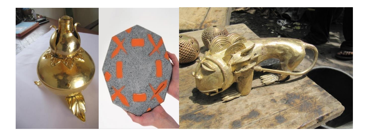
Figure 2. A B C A: A Jewellery Box, by (Augustine A. Frimpong). B: Concrete tile, by (Kjersti Holjem) C: The "Asanteman lion", by (Augustine A Frimpong)

The images in Figure 2, ABC are part of the data collected in the case study; they show how some student designs have been influenced by cubism. The findings from this participatory design shows how this stage of the research examined how certain categories of people, that is, design students and people outside the design field, view the role of Cubism in design. The purpose of this was to involve all stakeholders in design, both people who design and those who use designed works. The outcome also showed that most design students had used cubism in their works but they not know, reasons ranged from not knowing what it was to reasons such as liking the complexity of cubist works. The images in Figures 3 and 4 are images from the participatory design stage of the research.