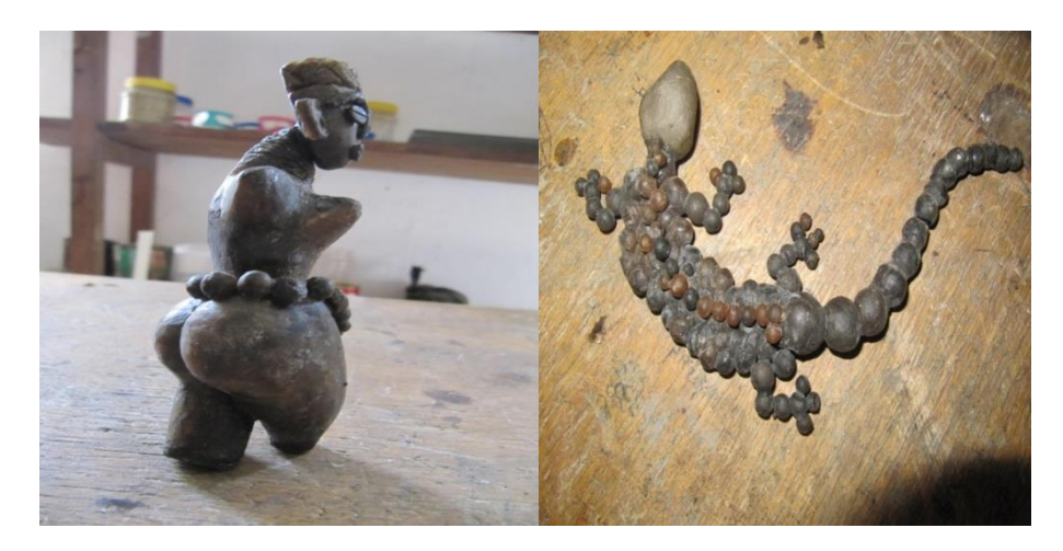
Figure 3. The African Fertility Doll

Figure 4: This lizard is also made of wax, was made from joining together different sizes of wax balls.