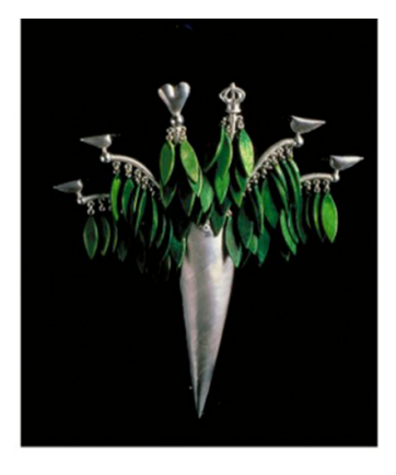
Figure 1 (left). LAUVSYLGJUR jewellery