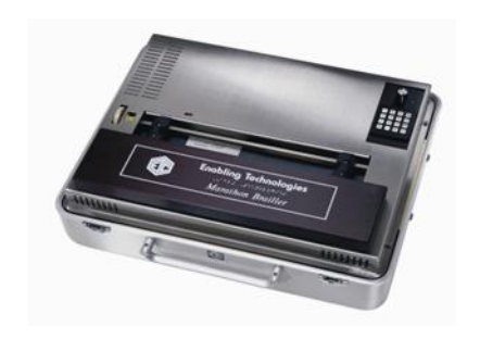
Marathon Braille Embosser