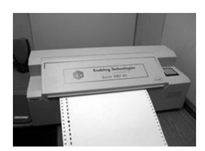
Juliet Pro 60 Braille Printer Source<sup>7</sup>