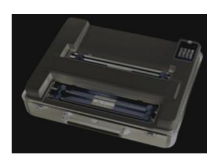
Braille Express 100 Embosser.