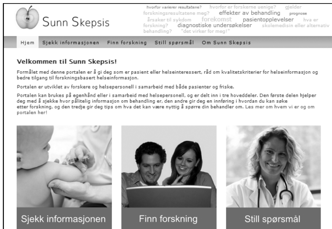
Figure 3 Front page of the web portal providing access to the three sets of tools

We presented the content in an easily accessible and structured way organised around the three sets of tools 'improving critical skills', 'enabling exchange of health information' and 'improved access to reliable research-based sources of health information' as points of departure (see Figure 3). In this way, users have the option of quickly locating the tool or information they need, such as, for example, help to find information on how to prevent the common cold. This approach does not force users to view the information in a certain specific or prescriptive way when accessing the portal, tools or databases, and allows them to choose what they want to read and when .