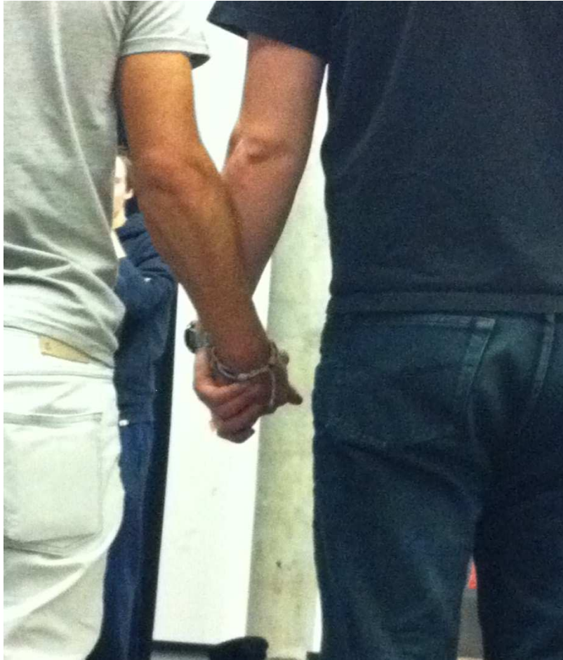
From the SFT process.