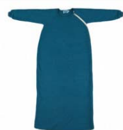
Organic Wool Fleece Sleeping Bag with Sleeves £58.00

Why choose organic bedding for your baby? Some of the most toxic chemicals in existence are used on conventional cotton crops as pesticides and insecticides. It's picked, processed and dyed using more chemicals, the residues of which remain in the fabric. Babies spend up to 20 hours a day sleeping (although we know it doesn't feel like it!), so we think providing a synthetic-chemical free organic baby bedding is definitely a good thing. Our organic sheets are a safe, healthy choice; no nasty residues or flame retardant chemicals. Because wool has been proven to aid sleep, have lots of organic baby sleeping bags and organic baby blankets pure merino wool. (Lana Bambini http://lanabambini.co.uk/store/organic-baby-bedding.html )