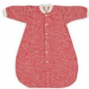
Organic Wool Fleece Baby Sleeping Bag £38.00