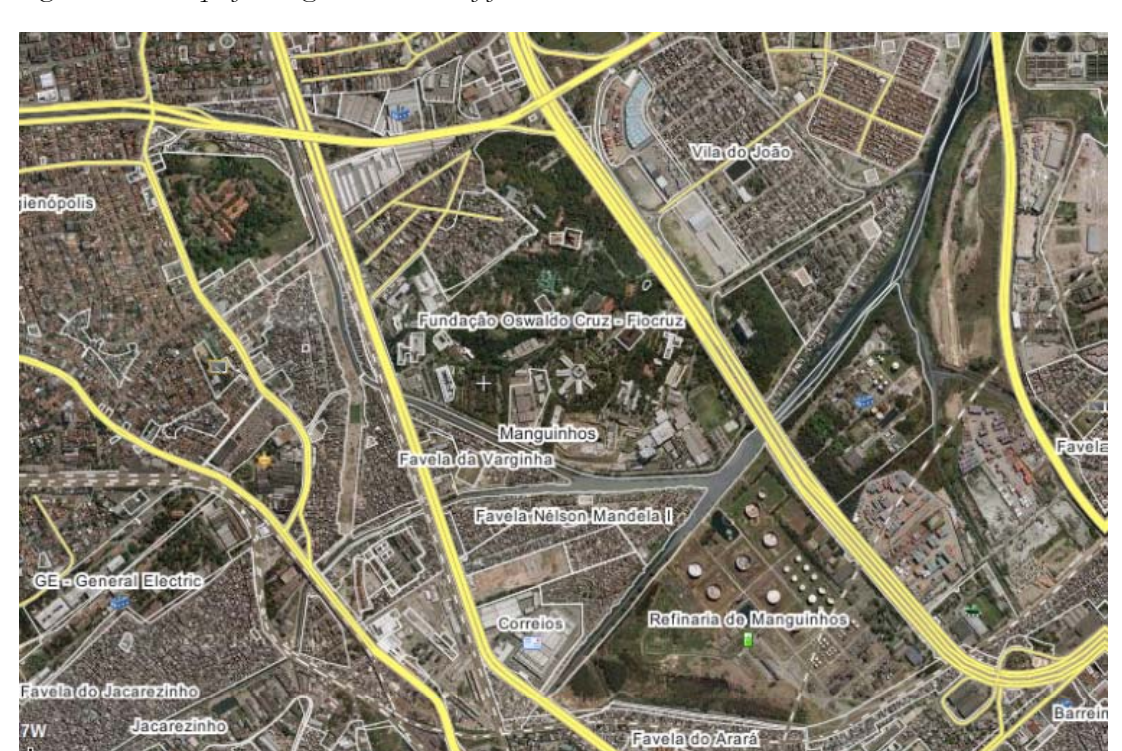
Figure 5.1 Map of Manguinhos cluster of favelas

The residents of Manguinhos are, mostly, migrants of first, second or third generation originating from rural areas of Brazil's North-east and having come to Rio on the search for work opportunities in industry and construction works from the 1960s onwards (Freire and Souza 2010). The overall population is 50,000, of which 53 per cent are women.