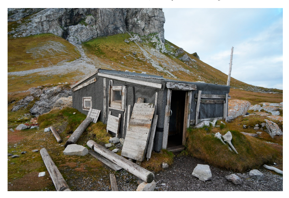
Figure 2. Gnålodden at Hornsund on southwest Spitsbergen in Svalbard was the southernmost case site. The small hunter's cabin, which was erected sometime before 1935, is automatically protected and signifies a historic site. This cabin is a highly typical cultural heritage site in the archipelago.