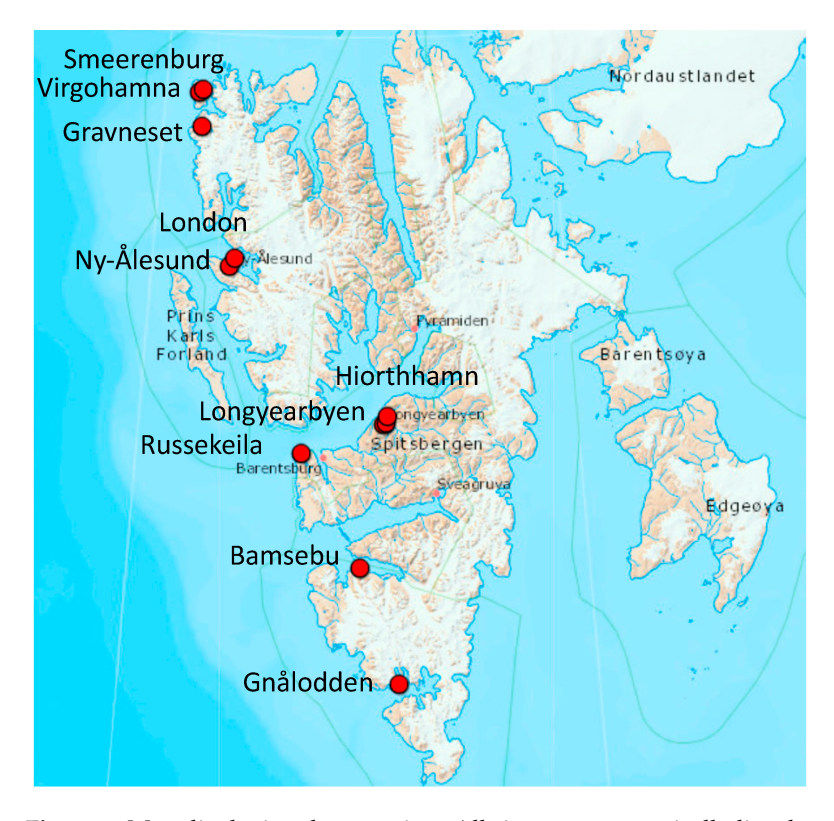
Figure 1. Map displaying the case sites. All sites are automatically listed according to the Svalbard Environmental Protection Act [3] (§ 39). Map based on Norwegian Polar Institute.