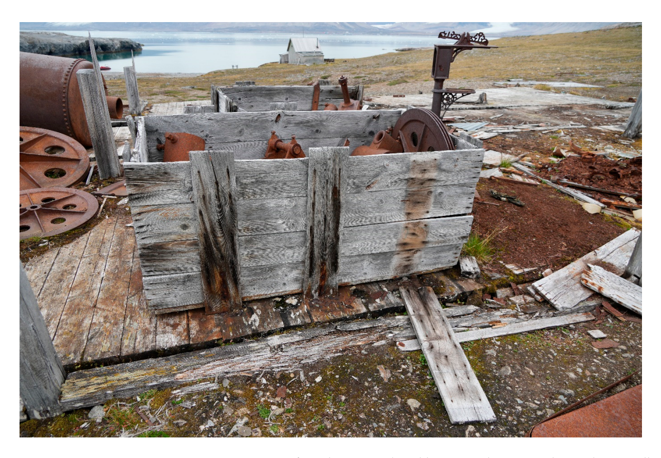
Figure 4. Historic remains from the protected marble mine settlement London at Blomstrandhalvøya in Kongsfjorden. Visitors trampled on the remaining wooden floor, destroying the wood.