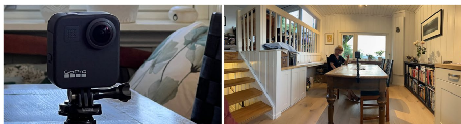
Fig. 3 To the left, the 360-degree camera used to film all videos. To the right, film set example, with all on set except for the actor out of the camera's field of view. A written permission to display the camera and company logo was obtained from the copyright holder

The test instructions were translated into Norwegian by author MM in collaboration with author ML. To familiarize participants with the virtual environment it was