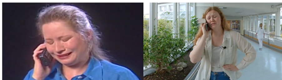
Fig. 2 To the left: A screenshot from an emotion recognition video in the original TASIT. To the right: A screenshot from the corresponding video in VR TASIT