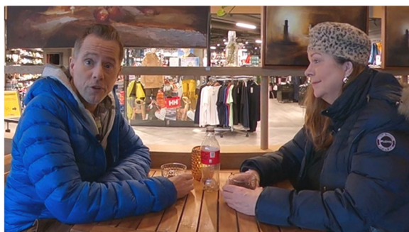
Fig. 1 Example of an actor turning to the camera to enhance the level of social presence

Filming commenced in August 2021 and finalized in March 2022. Five days of filming were required to film the 61 videos. In all, nine different locations were used. Two were private residences, the rest public settings (cafe, public library, office building, and hospital). At all sets, different rooms and spaces were used to maximize novelty. A clinical neuropsychologist (M.M.) was present on set to ensure that the actors performed in accordance with the requirements of TASIT. Before each scene was filmed, the actors were told the question(s) participants