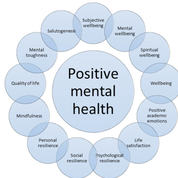
Figure 2: Dimensions of Positive Mental Health Included in the Studies