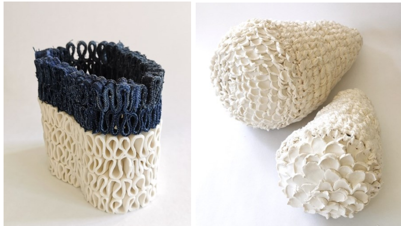
Figure 16. Little Blue Wave (left), White Creatures (right) (Swang, 2022).

Mimi Swang has combined porcelain/stoneware with different textiles, such as blue jeans and white shirts, used as symbols of the industrial- and the technological eras. What is the value of manual craftsmanship in the age of efficiency? Mimi Swang explores the possibilities of the materials in combination with traditional textile techniques. In her works she plays with the idea of the brain's ability to independently and spontaneously determine or change an overall plan during the process of creating, in contrast to automation of labor.