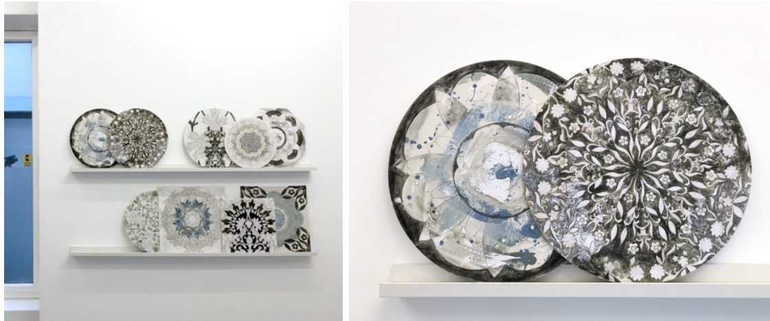
Figure 14. As long as it takes (Kielland, 2022) wall installation (left), detail (right).

drawing parallels to ceramic traditions. The motifs are for the most part stylized elements from nature put together in a rhythmic, ornamental expression. Her work unfolds manually over time, subject to something uncontrollable. Time is needed to make the most of the unexpected. Time to make room for the unexpected and time to do the right thing at the right time.