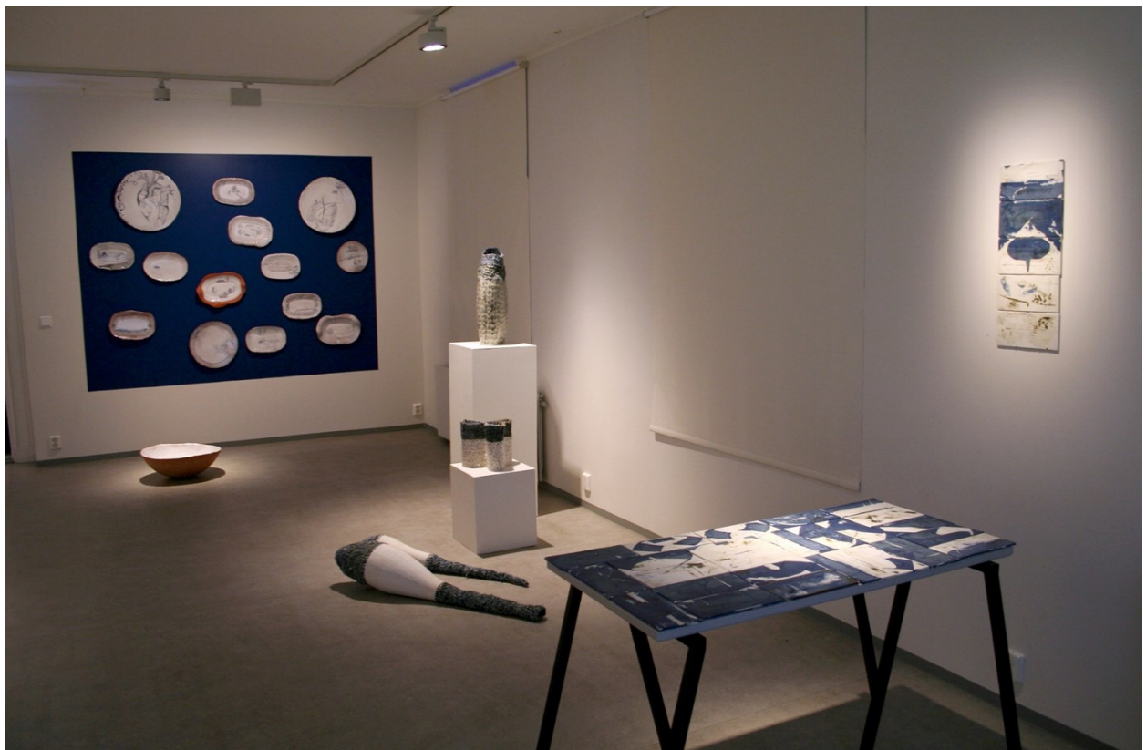
Figure 11. Installation 'Blue Collar – White Collar', Craft 2018.

The art critic Gjertrud Steinsvåg wrote about the room installation 'Blue Collar – White Collar' (Steinsvåg, 2018), with art objects and the short film included, at the annual craft exhibition in Norway in 2018 (Reiten & Holt, 2018): She wrote that despite many fine contributions, there were two works that made her pulse race a bit faster than normal: one of them was the project 'Blue Collar – White Collar' (Figures 11, 12):