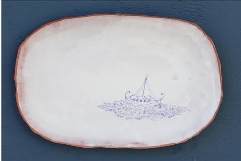
Figure 10. Blue Willow series/Boat and fishing rod (Lothe, 2020), from wall installation.

that have been crocheted in one or two different denim fabrics. The combination is unexpected, in a sense a free choice, and is also varied across ten different works. Clearly, her imagination sits in the front seat, even though the technical execution is of the highest class. (Figure 9) (Boel Ulfsdotter, 2017)