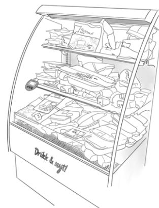
Figure 2. Example from Meny. Text translation: ‘Drink & enjoy’