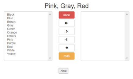
Fig. 2. Multiple list box selection. Selected items appear on the right.

The multiple list box selection had 12 options (see Fig. 2). Options were moved from left to the right list box when the user selected one or more items and clicked on the right double arrow. Ctrl+click was used to select multiple options. Moreover, a double click on a option would move it to the opposite list box. The "Next" buttons were used for moving to the next task.