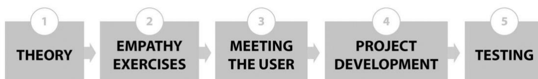
Figure 1. Course structure: From theory to prototype development.

Nineteen students (ten Brazilians and nine Norwegians) of the bachelor program in product design at UNESP and Oslo Metropolitan University (OsloMet) registered for this course. The course program was mostly practical and divided into four main blocks: (1) theoretical content on inclusive design, disabilities, and assistive and rehabilitation technologies, (2) practices of empathy development, methods of data collection, observation, and survey with people with disabilities, (3) meeting with real patients and assessment of their functional needs, preferences, and expectations, (4) project development, proposing solutions, and prototyping, and (5) prototype testing with the patients (Figure 1). The theoretical content, teaching methodology, and contact with students and professionals of occupational therapy and people with disabilities were clearly stated in the course description; thus, the enrollment in the course was by spontaneous demand. The pedagogical methods did not include critique from either peers or teachers.