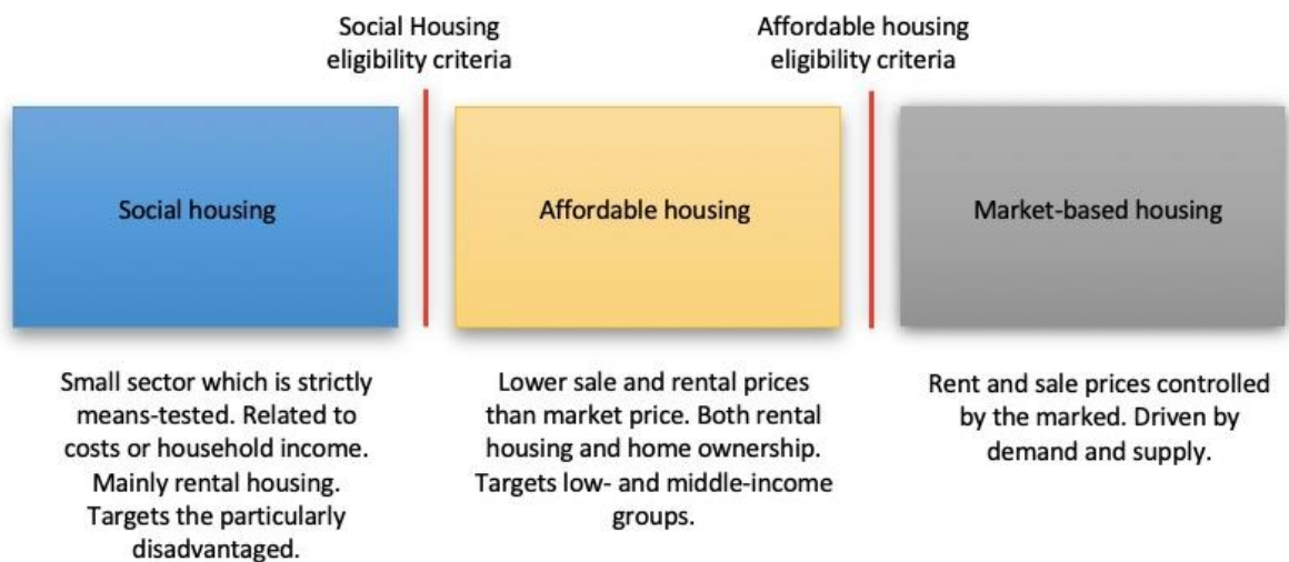
Fig. 2 Rental and home ownership segments in Oslo

I have adapted the model to describe the housing segments in Oslo, where the provision of affordable housing includes both home ownership and rental housing. This model is used as a point of reference in this paper and forms the basis for the discussion and analysis of the affordable housing policy in Oslo.