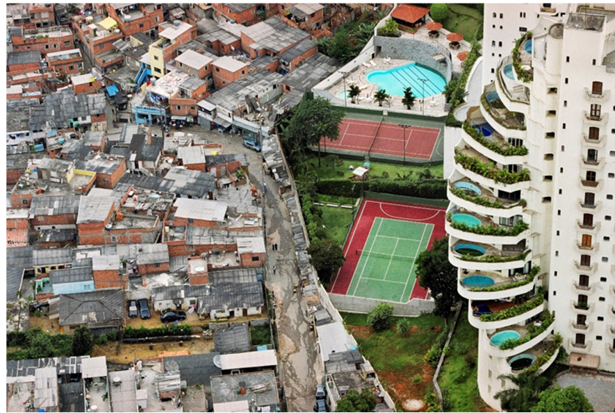
Figure 2. Physical boundary between Paraisópolis and the Morumbi neighborhood [51]. Republished with permission from the author.