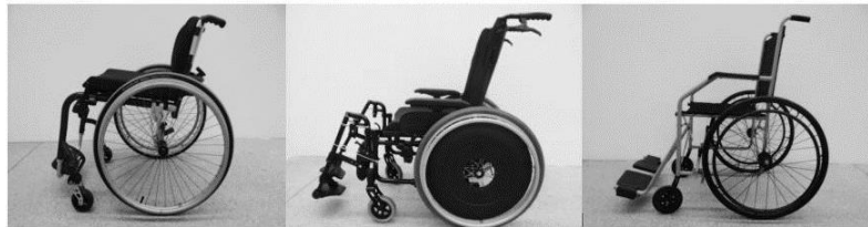
Fig. 1. Manual wheelchair models (from left to right): rigid-frame wheelchair; foldable-frame wheelchair; hospital model wheelchair.

Three models of adult manual wheelchairs (Fig. 1) commonly seen in the Brazilian market were used in this study: a rigid-frame wheelchair (RFW) with a mass of 11.55 kg, built with tempered aeronautical aluminum alloy, pneumatic tires in the 24'' rear wheels and foam cushioned seat; a foldable-frame wheelchair (FFW) made of steel with a mass of 21 kg, with backrest tilt and leg/foot support adjustments, pneumatic tires in the 24'' rear wheels, and foam cushioned seat; and a hospital model wheelchair (HMW) with a mass of 15kg, frame made in iron, seat and backrest in fabric and solid tires in 24'' rear wheels.