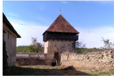
Figure 3. Cobor village – Fortified Reformed church.