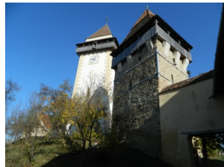
Figure 7. Apold village - The Evangelic Fortified Church.