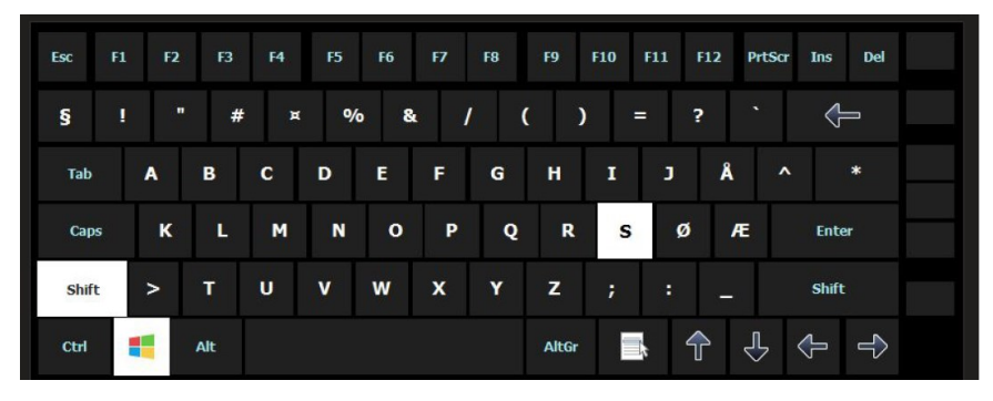
Fig. 1. A screenshot of the virtual alphabetical keyboard in dark mode.

balanced set comprising 8 participants with a preference for dark mode and 8 participants with a preference for light mode. The recruiting process revealed that there were slightly more people with a preference for light mode, yet it was relatively easy to recruit a completely balanced set of participants with both preferences.