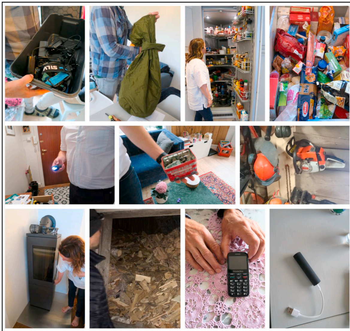
Fig. 2. Participants displaying material preparedness.