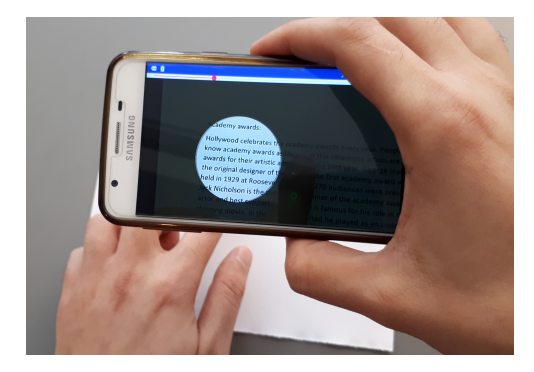
Figure 1: Panning by tracking the fingertip on the paper.

reading surface instead of moving the device. The user would hold the smartphone in a fixed position above the reading surface with one hand while controlling the pan by moving the index finger of the other hand by dragging it along the reading surface (see Figure 1)