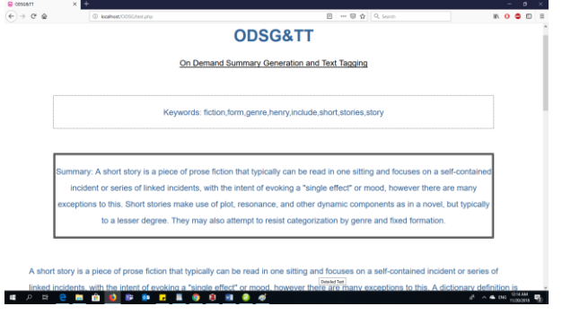
Fig. 2. The webpage appears with ODSG&TT executed.