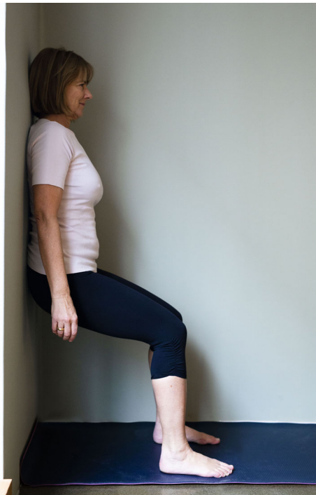
Figure 2. Exercise designed to fatigue the major muscle groups of the legs and pelvis.

Letting the body surrender control allowing the body to shake is the main part of TRE work and is happening during these sequences, especially when the pelvis is resting on the floor. The shaking then is the body's innate response to lower the tension level built up during the exercises (Figure 4).