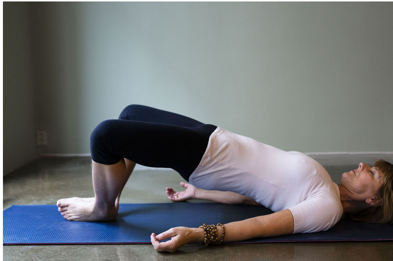
Figure 3. Exercise designed to fatigue the pelvic psoas muscles.