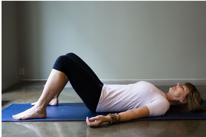
Figure 4. Letting the body surrender control allowing the body to shake.

The students' access to tremors often increases after they have become used to and familiar with the basic TRE exercises. Shaking can last for 10–30 minutes.