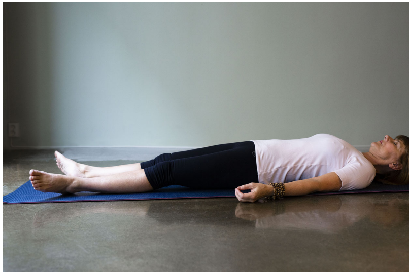
Figure 5. Open attention noticing changes and body sensations.

observing and supporting the students both physically through different types of touch and by creating a safe environment using the voice.