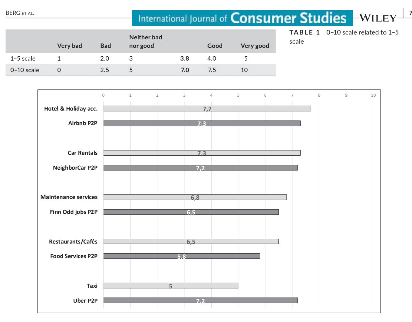
FIGURE 1 Consumers' contentment with P2P platform service markets (dark grey) compared to equivalent conventional service markets (light grey). Average mean scores (0–10) based on the indicators comparability, trust and satisfaction. (N for P2P platform services = 819, 170, 75, 308, 107, 654. Conventional markets N = 500 pr. market, Taxi N = 913)