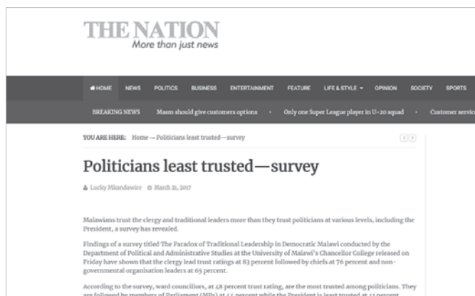
Figure 21.4: Screenshot from The Nation newspaper's coverage of PAS-SUM Norhed research findings presentation, 21 March 2017

public sector so that it is equipped to deal with 21st century challenges. It is expected that this will lead ultimately towards the building of a critical mass of more, and better qualified, Malawians who can engage with political and economic elites and policy-makers, and thereby positively influence decision-making processes related to democratic and economic governance.