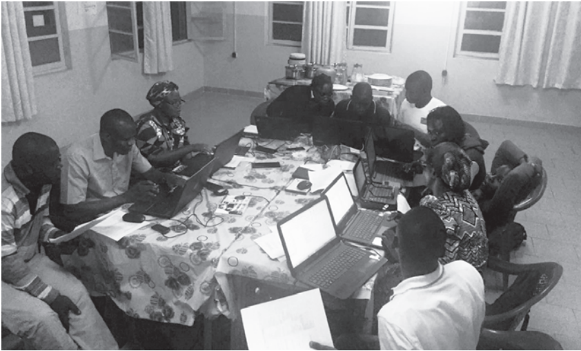
Research site in Popokabaka

2019, 31 students have graduated from the master's programme and one student from previous cohorts is preparing to submit his thesis. The last seven are planning to graduate in early 2020. Two students have dropped out and one is uncertain. In addition, six PhD students have been enrolled, two have graduated, two have dropped out and two are planning to defend their theses in 2020.