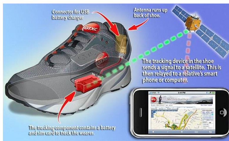
Fig 2.1: A modern Insole GPS tracking system.

Research on four different biomechanical activity devices to index wandering, Algase et al. (2001) found the Step Watch particularly useful to assess the amount and daily course of wandering behavior in people with dementia. In this study, Boundary alarms (activated by a wristband) or tagging patients electronically and monitoring stations were found to be effective, reliable, less time consuming, successful and economically beneficial. The study also indicates the use of these tracking devices to reduce both patients and caregivers stress (Miskelly, 2004). A bedside tracking device system was tested in a memory clinic with Dementia patients who frequently immobilized from the room at night, additionally provides floor motion sensor lights and alert the carer by alarm so that they can perform the necessary intervention (Masuda et al., 2002).