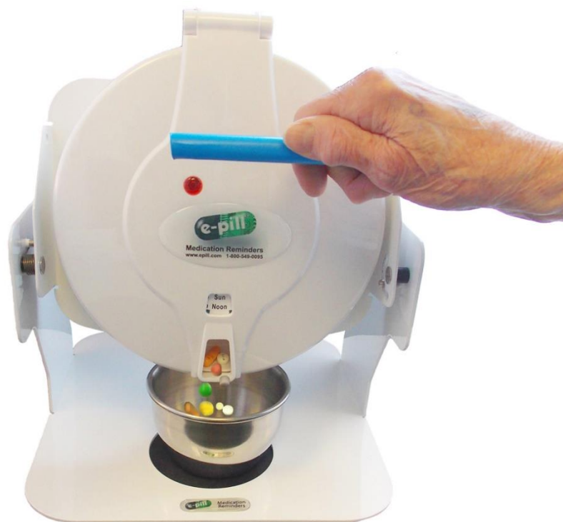
Fig: 3.1: A modern Medicine Dispenser.

To evaluate the available ATs provided by the different municipalities health service, I visited four different municipalities health service office, one NAV office and one exhibition held at "ALMAS HUS" in Oslo for the PWD. Visited Municipalities are Oslo, Bydal, Drammen, and Lervik. This study shortlisted two such ATs that are mostly provided by all the Municipalities for PWD.