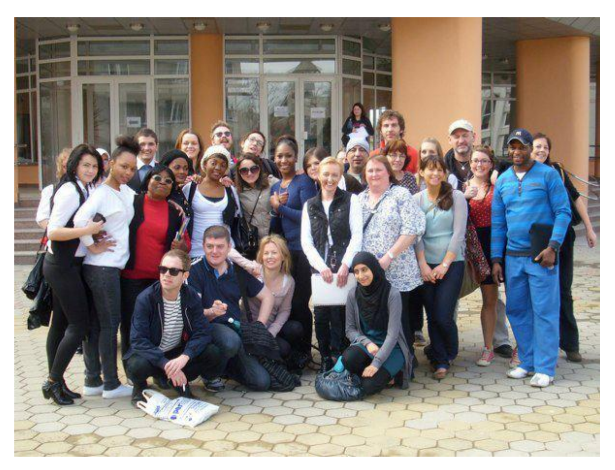
Students from England, Scotland, Romania, Sweden and Norway in between lectures at the Erasmus Intensive Programme at University of Oradea, Romania, 2011

The first intensive programme module (IP) Inclusion of persons with disabilities in employment, education and health services , aimed to examine inclusion of persons with disabilities from a cross-national and multidisciplinary perspective in a bid to compare and share good practices amongst the participating countries (siu.no). Three major thematic areas were addressed; employment, education and health services. The IP reviewed the welfare systems in the participating countries, the policy backgrounds as well as practices of inclusion within employment, education and health services. A comparative approach would, we believed, extract and demonstrate the "best practices" within these areas. The IP comprised one formative assessment, ten days of lectures, seminars and workshops in international groups followed by a summative assessment.