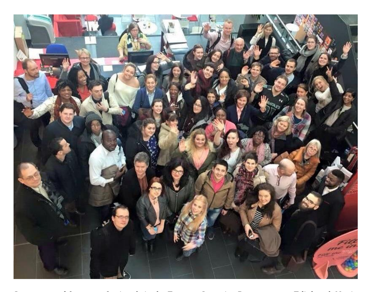
Lecturers and future professionals in the Erasmus Intensive Programme at Edinburgh Napier University, 2015