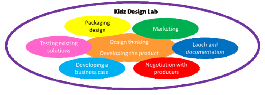
Figure 3. The scope of Kidz Design Lab

KDL represents a specific design methodology, which has been applied in the context of kids. Still, the method has the potential to have far-reaching applications beyond this context. The methodology points to the involvement of potential users and customers as designers as a way to develop, market and sell products. Such customer involvement could be just as appropriate in the case of for example students, elderly or middle-aged office workers. To further test the generalisability of the methodology, future research and practice should aim to test it across contexts.