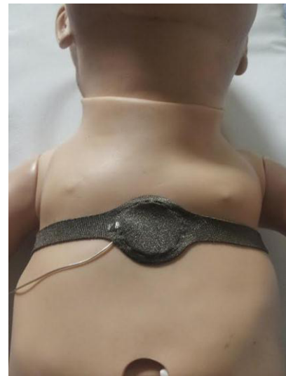
FIGURE 1. The placement of the FingerTPS™ palm sensor on the manikin's chest.

The FingerTPS™ system has a set of force sensors that can be put on the fingers and in the palm. For the purpose of this study we used the recordings from the palm sensor strapped around the manikin's chest, with the sensor pad placed over the lower third of the sternum (Fig. 1). This is where the participants were asked to focus their thumb force during CPR. The force was measured continuously in pounds (lbs.) and recorded using the Chameleon software (PPS, Los Angeles, CA). The participants were blinded to the force tracing during the experiments and were allowed to rest for at least four hours between each CC method