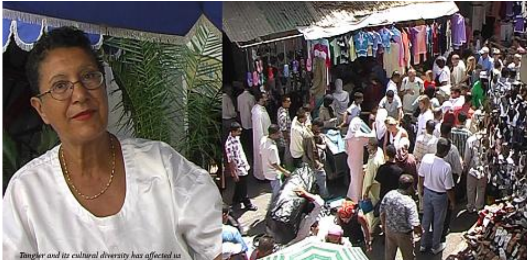
Figure 4. Snapshot from the video edited in two part: the left side shows a female native inhabitant of Tangier telling her experience of her city: “Tangier and its cultural diversity has affected us”. The right side shows every-day scenes in the street.

the interrelation between its different parts. Such as Tangier's diverse cultural live and Oslo's suburbs and its new neighborhoods. The goal was to get an understanding of the city by filming public spaces as seen through the participants' personal relations to these areas. A significant aspect was that the natives could tell me the story of the city that history could not give me.