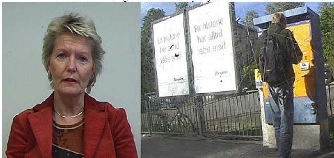
Figure 3. Snapshot from the video edited in two parts: the left side shows a female native inhabitant of Oslo telling her experience of her city: “Oslo had several communities, but they were very similar”. The right side shows every-day scenes in the street.