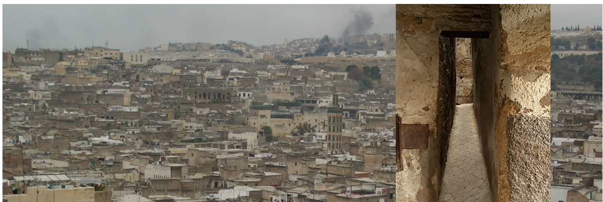
Figure 1. Fez: A composed picture I edited from two different points of views from the city of Fez, Morocco. This juxtaposition shows an overview of the medina seen from roof terrace (called stah in Arabic), contrasting with a small pathway (called deb in Arabic) on the ground level.

The figures below are screenshots from the video. The first is a collage of two photographs I took in Fez showing the city from two different positions (nadir/bottom and zenith/top). The next two figures below are two drawings made by the participant: Fez on the left, Oslo on the right.