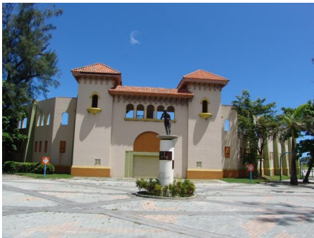
Image DSC06932.JPG, showing a sunny outside motive, is taken at noon (12:07) Saturday July 22 during the summer of 2006. The image occurs on the second day of a 8 day event entitled "Americas-PuertoRico-SanJuan " that takes place in Americas (67 degrees North, 75 degrees West). This image is automatically annotated.

Manual note: the image is taken in the morning in the city center of Vancouver, Canada. The photograph shows a car driving through an intersection.