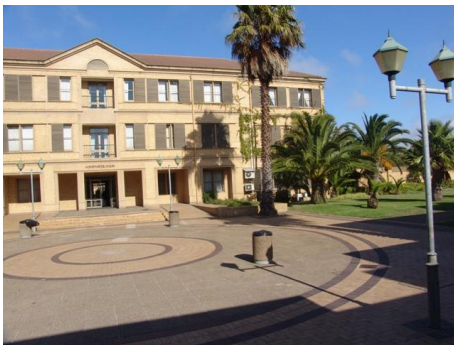
Image DSC08919.JPG, showing a sunny outside motive, is taken in the late morning (11:33) Friday February 27 during the winter of 2009. The image occurs on the fifth day of a 6 day event entitled "Africa-SouthAfrica-CapeTown " that takes place in Europa/Africa (78 degrees South, 21 degrees East). This image is automatically annotated.

Manual note: the image is taken at noon in the Old Town of San Juan, Puerto Rico showing a gate.