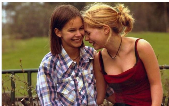
Figure 2: Photo from the movie "Fucking Åmål"

It is hard to illustrate bisexuality in pictures, and I have not found good examples of that, and no good photos connected to transgendered persons either. The LGBT related illustrations that do not show two persons of the same sex are most often rainbow flags (eight instances) or other kinds of logos. There are also other illustrations: one photo of concentration camp prisoners with pink triangles, some pictures of historical persons (Sapho, Oscar Wilde, Erling Lae, Gro Hammerseng and Katja Nyberg, Siri Sunde, Kim Friele and Wenche Lowzow) and a photo where someone has written "Bjørn is gay!" in the road.