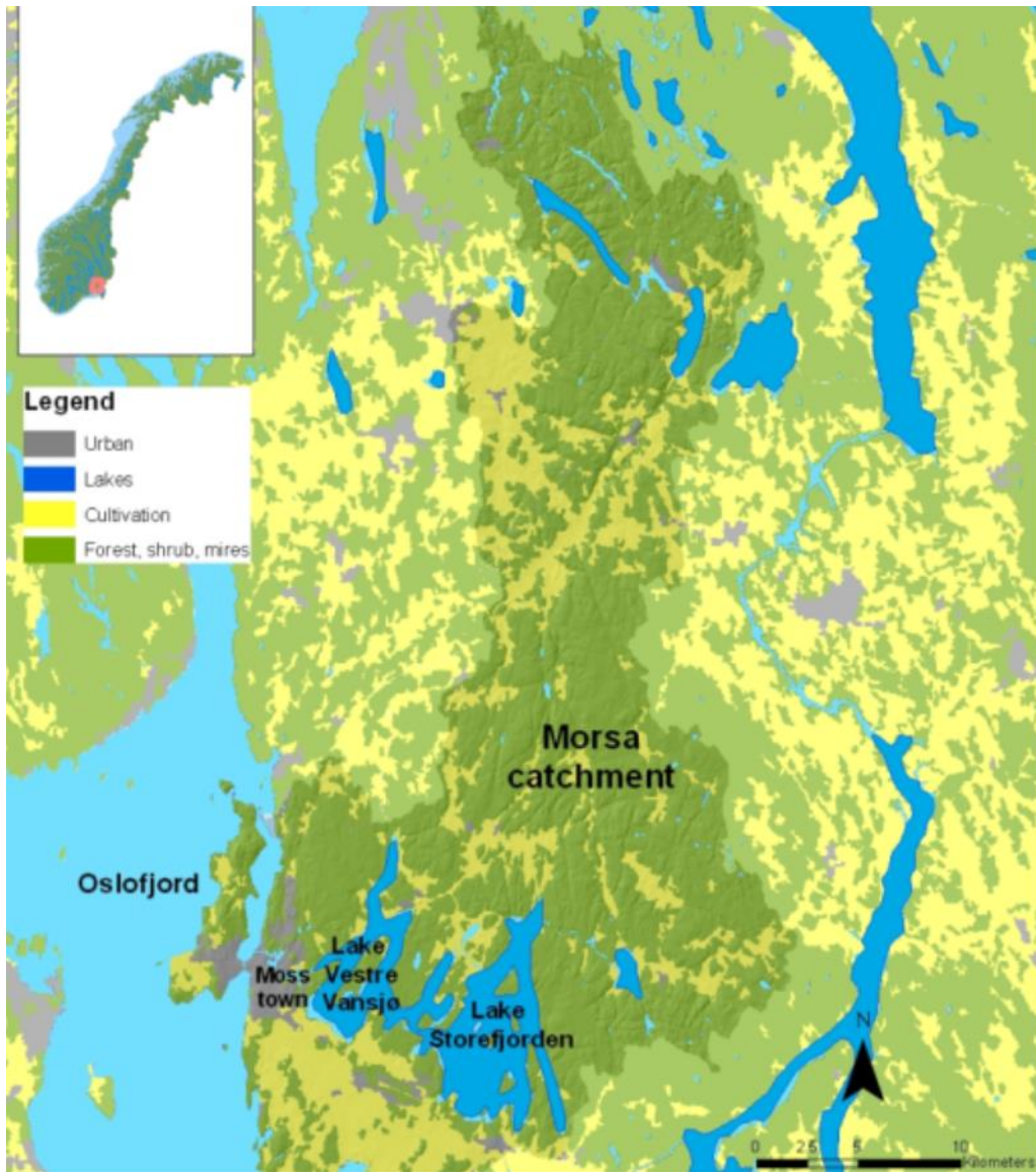
Figure 2 The Morsa Watershed (dark green area)

As to the social science part, document studies, interviews, and questionnaires were applied. They comprised both qualitative and quantitative methods. The Eutropia 2 project included semi-structured interviews with 23 farmers. The selection of farmers included farms of different size and location, and type and form of production; as well as farmers of different age and local engagement (role models or not). The interview guide included