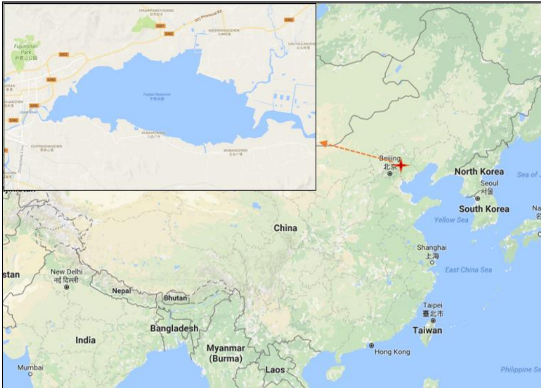
Figure 1 The Yuqiao reservoir

respectively. Lake Vansjø is a recreational and leisure area for people living in Moss and the surrounding region, as well as a biodiversity rich area.