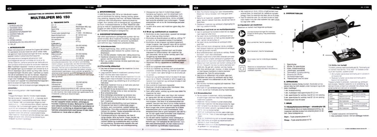
Figure 1. User manual for the dremel hand piece with add-on tools

In the second phase, the design professionals were instructed to redesign the manual for the dremel hand piece and add on tools. They were encouraged to comment on the user manual and its effect on the preparation for use of the product. They were also asked to judge the effect of the manuals on the product usage.