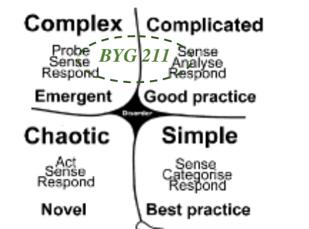
Figure 2. The Cynefin framework [6] with position of the BYG211 Computer Based Modelling and Surveying course

Combination of sustainability as design criteria, learning usage of BIM-based design tool for design, and working in teams, is very demanding. The Cynefin framework [6] can be used to understand which type of problem one is dealing with. Design is a challenging discipline by nature, and by including sustainability as assessment criteria the BYG211 Computer Based Modelling and Surveying course in position between Complicated and Complex in the figure 2.