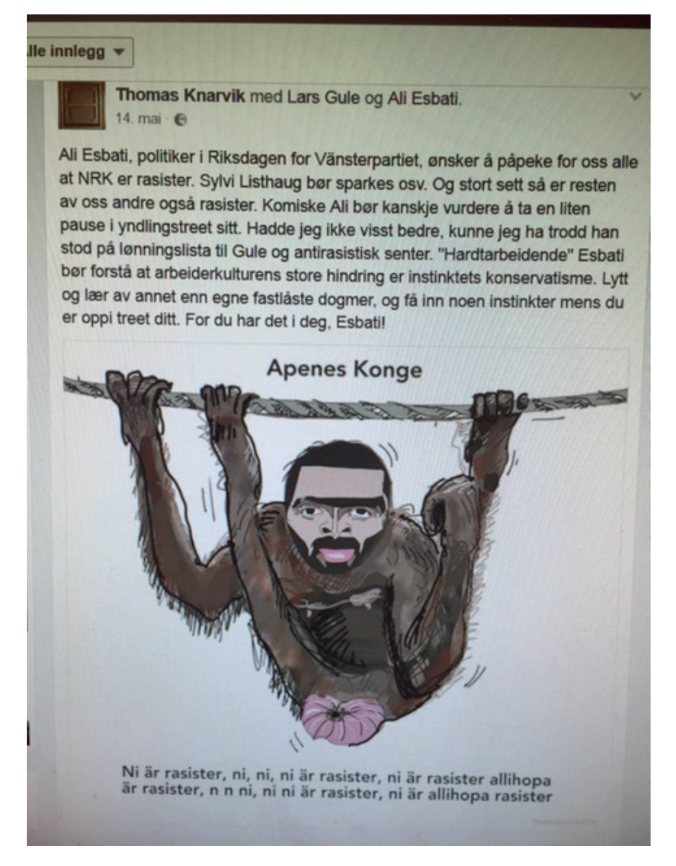
Figure 3.4. A facsimile of Thomas Knarvik's first Esbati caricature, "King of the Apes", as it appeared below a text by the drawer on his Facebook page on May 14, 2016. Facsimile reproduced in accordance with the Norwegian Copyright Act.