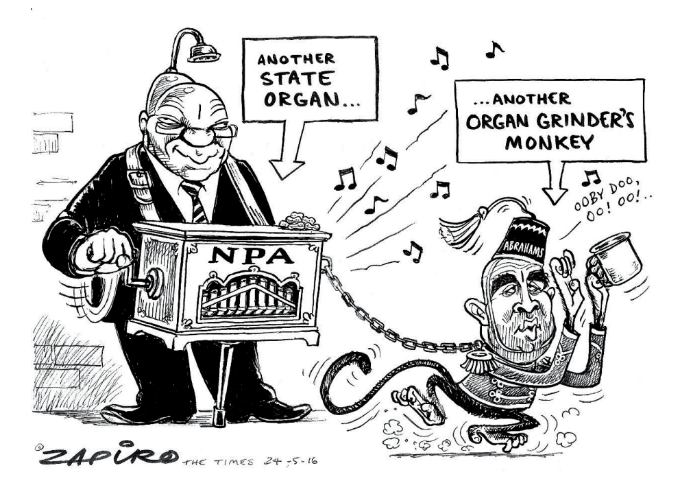
Figure 3.2. Another State Organ © Zapiro. Originally published in The Times , May 24, 2016. Reprinted with permission; no reuse without rightsholder permission.

current cultural context, or, more broadly, given the long tradition of denigrating black people by drawing them as monkeys.