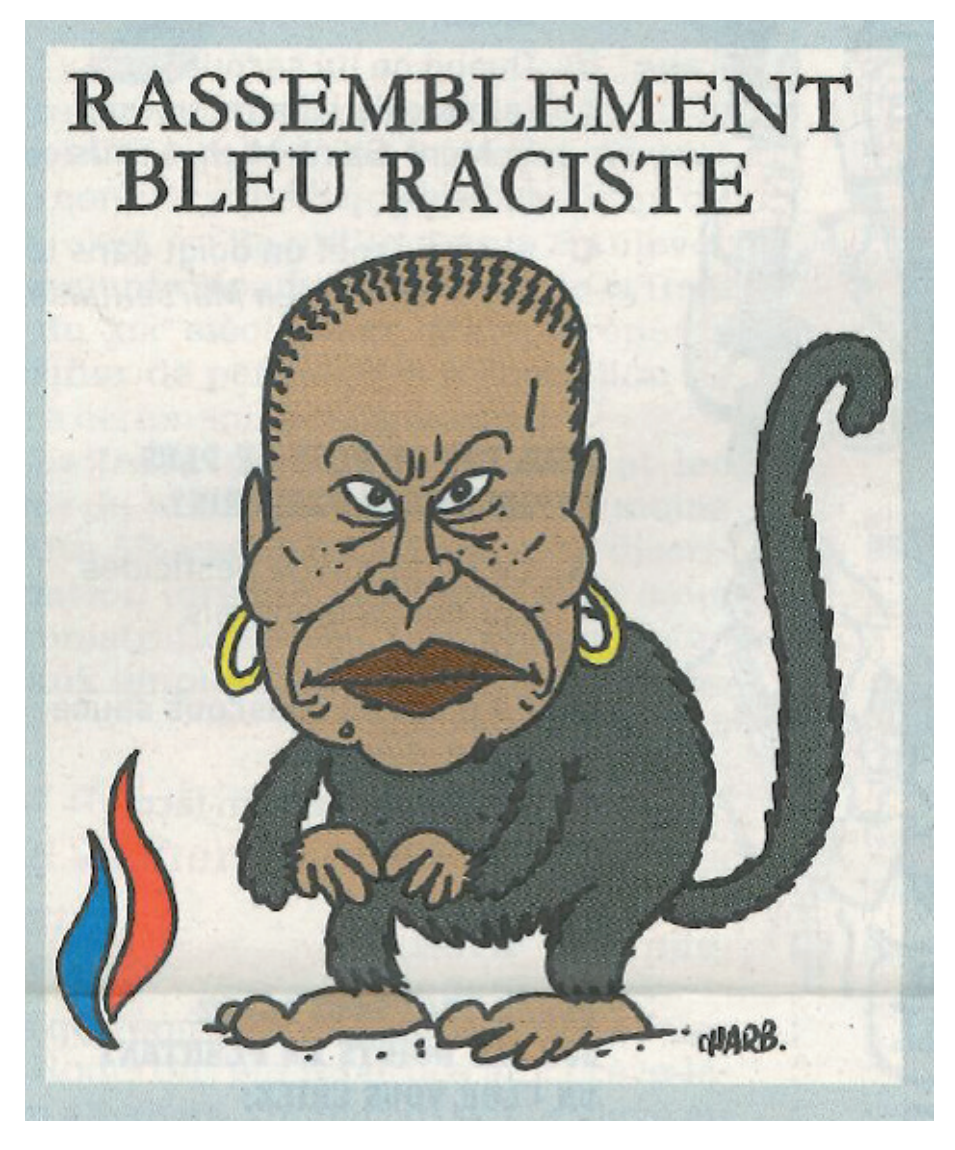
Figure 3.3. Facsimile of drawing by Stéphane Charbier (Charb), on page 16 of Charlie Hebdo No. 1115, October 2013. Facsimile reproduced in accordance with the Norwegian Copyright Act.

A reader who is not familiar with the cartoonist's subject matter may quickly jump to the conclusion that this depiction of a black person as a monkey is racist. Even if readers are familiar with the person portrayed, a hasty framing of the object of the satire as the politician Christiane Taubira herself would imply that the caricature was mocking the justice minister in a degrading