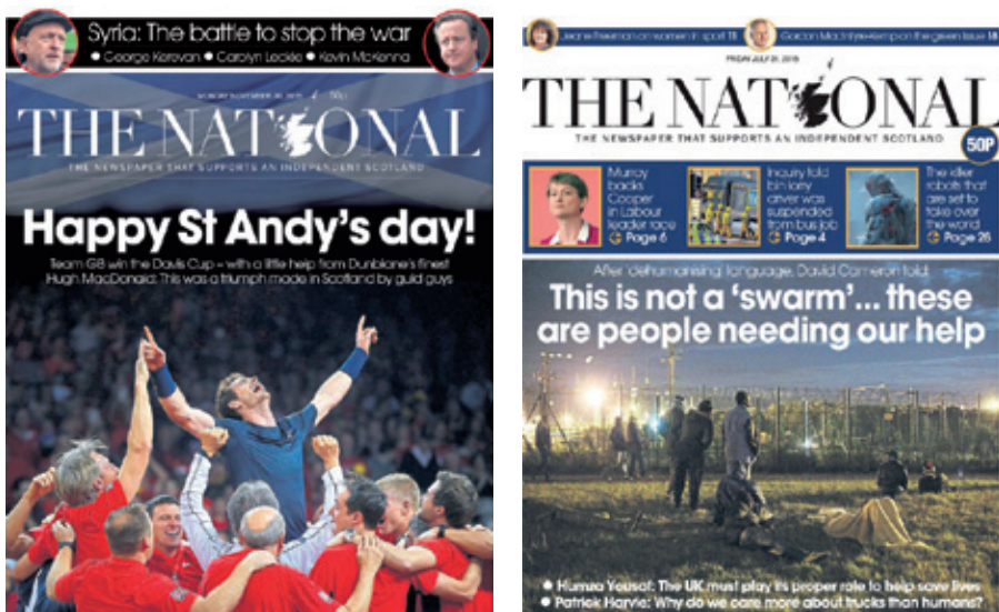
Figures 6.47 & 6.48. The comfort and loneliness of the crowd. Facsimiles reproduced in accordance with the Norwegian Copyright Act.