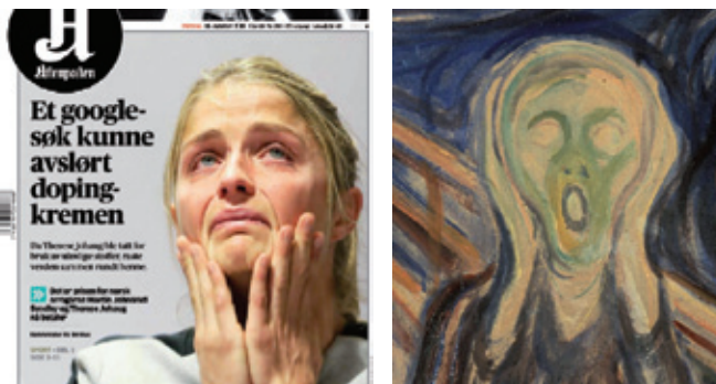
Figure 9.3. The photo of Johaug on the front page, Aftenposten 14.10.16 (see fig. 9.2 above), and the iconic painting by Edvard Munch, “The Scream” (1893). Photo: © Munchmuseet. Reproduced with permission; no reuse without rightsholder permission.

Vectors can also express action, often in the shape of imaginary diagonal lines in the image. A vector connects the participants as doing something to or for each other, expressing narrative patterns (Kress & van Leeuwen, 2006). In the photo of Johaug, a vector is derived by the direction of her glance, which is upwards and slightly to the right (to the beholder). This perspective indicates what she may be looking at. It also serves as an expression of how she feels. Johaug is looking at the ceiling, however, the posture may be