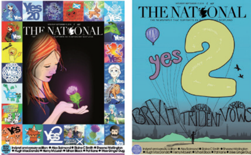
Figures 6.5 & 6.6. Two prize-winning front covers. Facsimiles reproduced in accordance with the Norwegian Copyright Act.

The great importance The National gives to its front covers was clear from issue 1 (shown above). This combined a metaphor of the Fourth Estate “watch-dog” function of the press (“we have our eye on you”) with the social issue of child poverty. On 8 May 2015 it published no fewer than three different covers related to the Scottish parliamentary elections the day before (the third appears as Figure 6.46 below), while on 17 September 2016 it published two different covers, these having been selected from designs sent in by readers (in the first immediately above, the thistle is a long-standing emblem of Scotland, while the “2” in the second refers to “indyref2”, an abbreviation widely used to refer to the possibility of a second independence referendum).