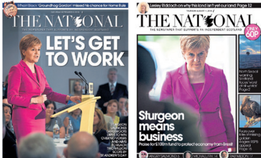
Figures 6.29 & 6.30. Nicola Sturgeon plays good cop/bad cop. Facsimiles reproduced in accordance with the Norwegian Copyright Act.

tends to be on a woman getting on with the job, an emphasis consistently underpinned by her businesslike but generally workaday dress code. Such representations can very exceptionally border on the aggressive, their unorthodox and slightly chaotic composition suggesting that things are about to get “shaken up”: