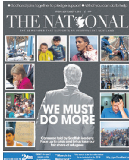
Figures 6.13 & 6.16. David Cameron in various negative guises. Facsimiles reproduced in accordance with the Norwegian Copyright Act.