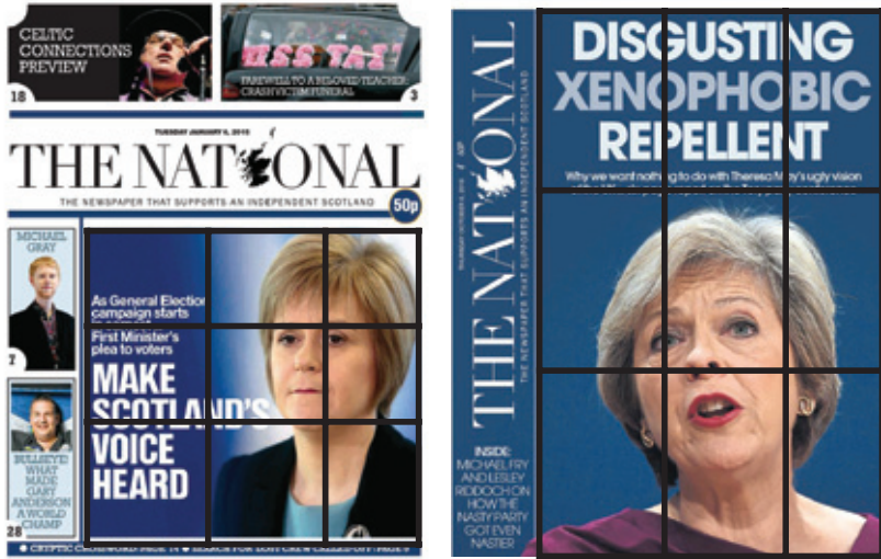
Figures 6.9 & 6.10. The rule of thirds applied to Nicola Sturgeon and Theresa May. Facsimiles reproduced in accordance with the Norwegian Copyright Act.

Immediately below is the third image to appear in The National (chronologically speaking) and featuring Jim Murphy, then leader of the Scottish Labour party and one of the most high-profile representatives of the “No” camp during the referendum. As can be seen, the slightest change in the direction of his gaze is enough to move his representation from neutral to decidedly “shifty”, while a perplexed-looking Jeremy Corbyn peering over his glasses looks like someone out of his depth: