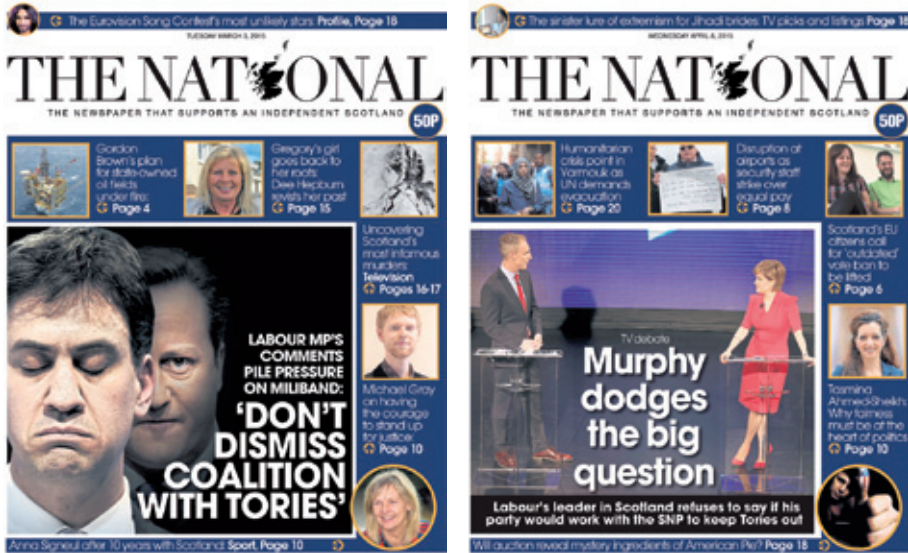
Figures 6.39 & 6.40. Nicola Sturgeon and Jim Murphy miles apart. Facsimiles reproduced in accordance with the Norwegian Copyright Act.

As regards haptics, we might usefully contrast Sturgeon’s rather formal handshake with Cameron with The National ’s presentation of her meeting with EU President Jean-Claude Juncker: