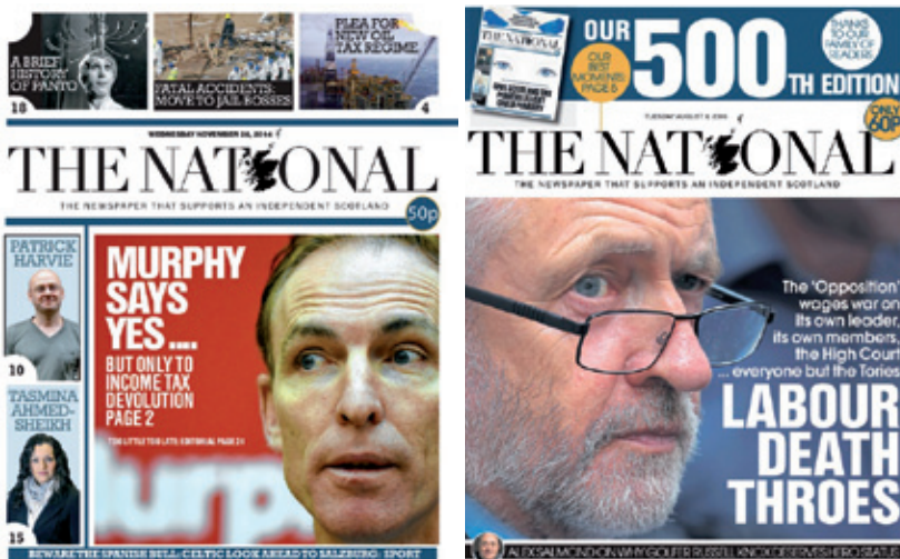
Figures 6.11 & 6.12. Jim Murphy and Jeremy Corbyn avoid the camera's gaze. Facsimiles reproduced in accordance with the Norwegian Copyright Act.

Immediately below is the third image to appear in The National (chronologically speaking) and featuring Jim Murphy, then leader of the Scottish Labour party and one of the most high-profile representatives of the “No” camp during the referendum. As can be seen, the slightest change in the direction of his gaze is enough to move his representation from neutral to decidedly “shifty”, while a perplexed-looking Jeremy Corbyn peering over his glasses looks like someone out of his depth: