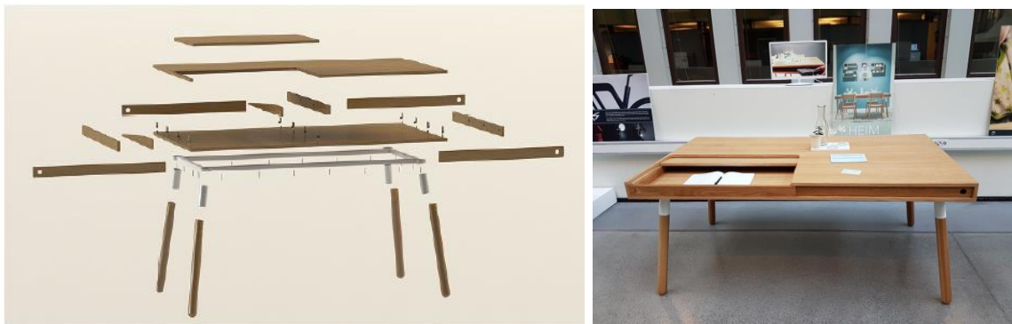
Figure 4: Student works, digital drawing and final prototype

The students experienced that they could use the programme in unusual ways. They had learned to use it in full application terms from the beginning; now, they were learning that it did not matter if you did the design process completely on the programme's terms, but that you can lower the difficulty for its own use and for different stages of the design process. They can use the programme as a sketch tool and not be overly bothered about the final drawings. They learned to think that they did not have to care about the application's requirements and that each individual can use it in their own useful way. This is an early stage, and eventually, they will need to make new drawings after making the first models. They can use a 3D programme to draw 2D sketches, and they understand that they can use the drawing programme without anxiety that something will go wrong. This attitude creates good educational end results in terms of improved motivation and learning pleasure. The exploded drawing portrays another way of using the programme (Figure 4).