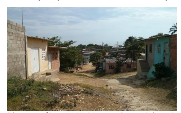
Picture 4. Siete de Abril is one of many informal settlements in Barranquilla inhabited largely by IDPs.

Serious complaints relate to the poor location (often outside of the built area of the city), overcrowding, use of cheap and prefabricated materials, lack of quality public spaces and commercial uses, as well as inadequate provision of health centers and police stations (Correra et al., 2014).