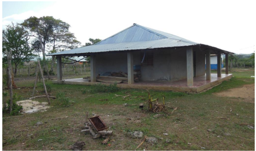
Picture 3. Vacant farm in El Carmen de Bolívar. It was restituted to the original owner, but he did not want to return there and take up farming again.

The advantages in the offer of Free Housing are reflected in the number of IDPs who have signed up for the program. It is estimated that up to 900,000 households are on the waiting lists for Free Housing across the country (MinVivienda, 2014b), compared with only around 73,000 claims for Land Restitution filed by June 2015 (Valencia, 2015). To date, some 100,000 households have benefited from the housing program, whereas only 1,368 restitution rulings have been passed for around 4,000 households (Valencia, 2015)— well below expectations and original estimates of the URT, as the plan was to settle 360,000 cases by 2021 (Sabogal Urrego, 2013; Semana, 2015a). Our interviews and observations indicate that the number of beneficiaries of Land Restitution who have returned and now live on their land is relatively low, although the exact figures are not known.