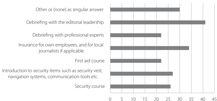
Figure 2. Journalists’ and editors’ own reporting of security training and access to equipment (number)

Norway and the Philippines come out as the two countries with the best routines for preparation and security in this survey. It is worth noting, however, the potential methodological impact of the fact that the Filipino and Norwegian journalists report longer work experience in their work than did the informants from the other countries in the survey. Given their experience in the field, they are more likely to be attached to international media houses with larger budgets and more advanced security routines than are the other informants. Those with more experience are often the ones best trained and equipped in relation to safety.