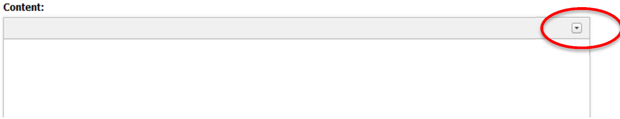
(a) editor with hidden menu (default setting in some cases)