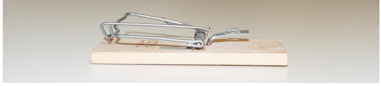
Figure 1. The mousetrap stroke design

The aim of this paper is to analyse the development of an everyday object: the mousetrap. This device has an anonymous design, is often mass produced and is primarily based on the requirements of function, simplicity and low cost. The construction of this object consistently follows these principles, which makes it transparent and, therefore, an interesting research object. Nothing—not décor or other aspects—interferes with the reading of the object.