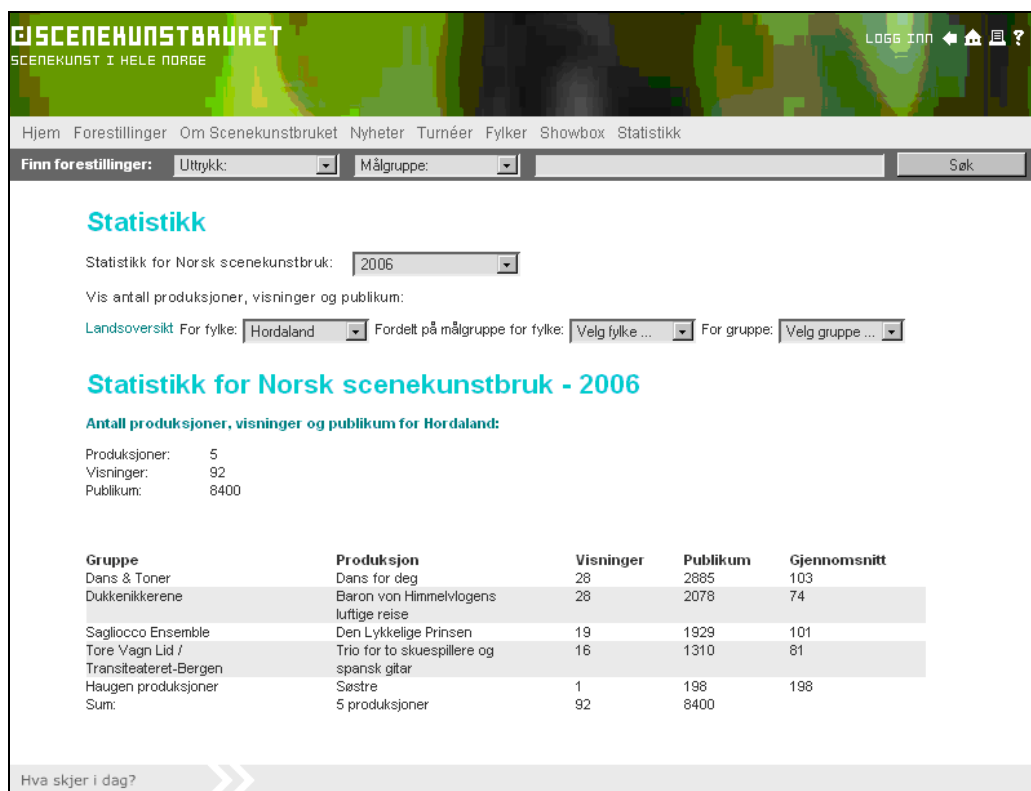
Figure 8 – Statistics from Scenekunstbruket ([2007]b)

This overview can be sorted by county, target group and by individual theatre group (the drop-down lists). The column headings translate as follows: