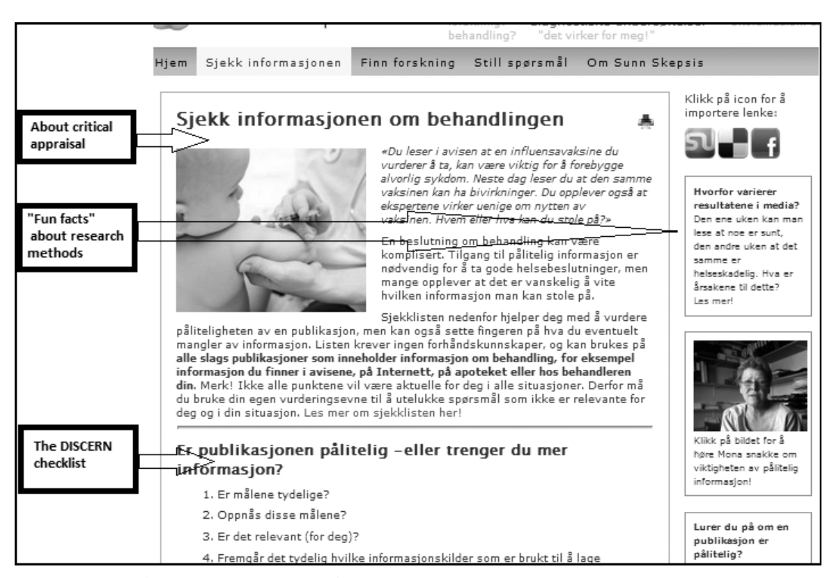
Figure 4 Example of structure and presentation of content

Results toolset 1: Improving critical appraisal skills. The web portal gives an introduction to medical- and health-related research methods and the basic principles of science across the three main tool-sets as small pieces of plain language text (see Figure 4).