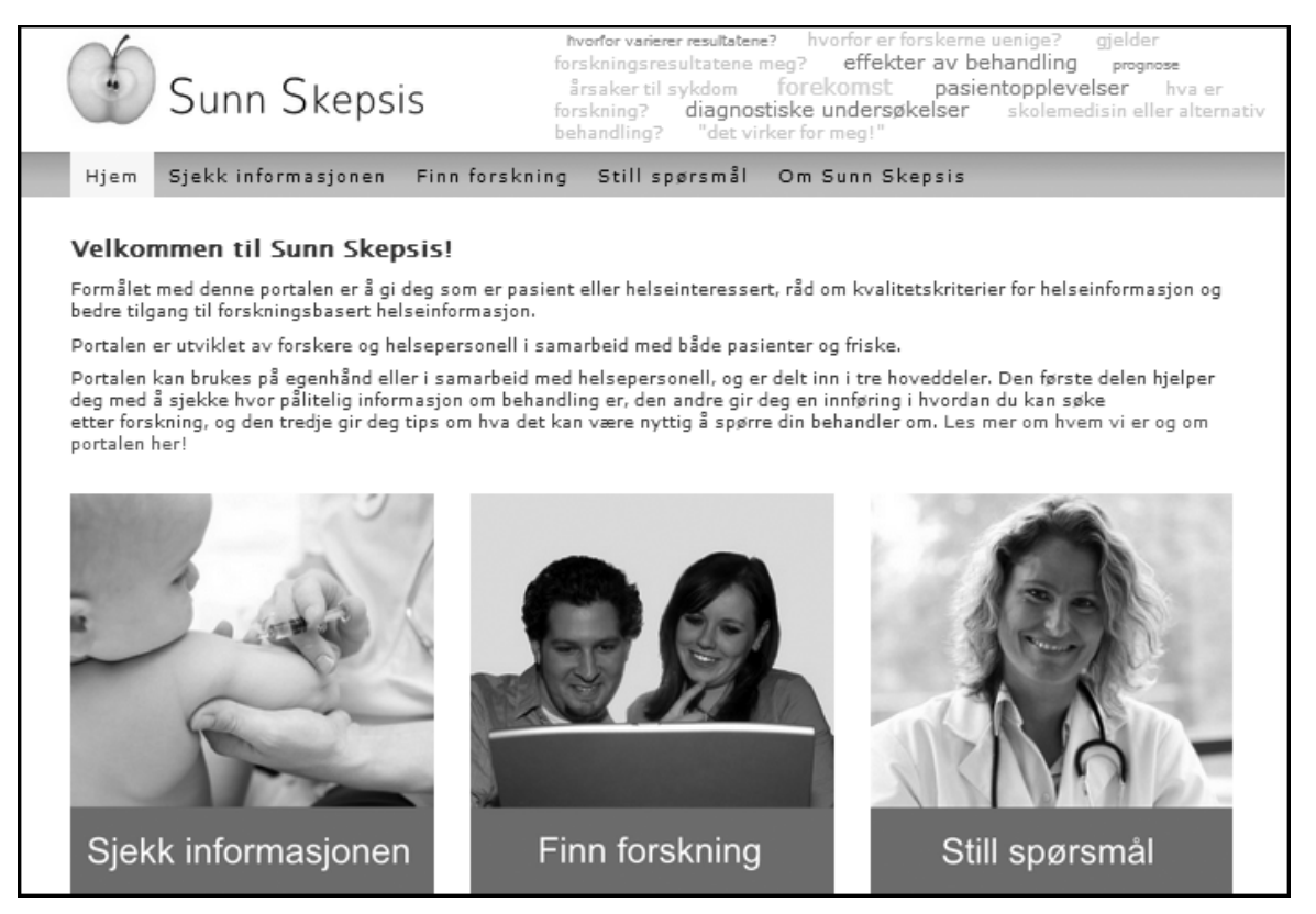
Figure 3 Front page of the web portal providing access to the three sets of tools

We presented the content in an easily accessible and structured way organised around the three sets of tools 'improving critical skills', 'enabling exchange of health information' and 'improved access to reliable research-based sources of health information' as points of departure (see Figure 3). In this way, users have the option of quickly locating the tool or information they need, such as, for example, help to find information on how to prevent the common cold. This approach does not force users to view the information in a certain specific or prescriptive way when accessing the portal, tools or databases, and allows them to choose what they want to read and when .