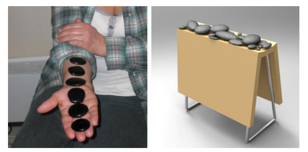
Picture 1. Testing experience with heated stones Picture 2. Spa radiator, Siri B. Persen

experiences it was intend to create. This additional analysis disclosed five typologies of activation namely: cognitive, motional, relational, perceptive and imaginative level (see figure 2.). The words written in italic in the text below, which describes the levels of activation identified, are situations that resemble with various strategies of CPA.