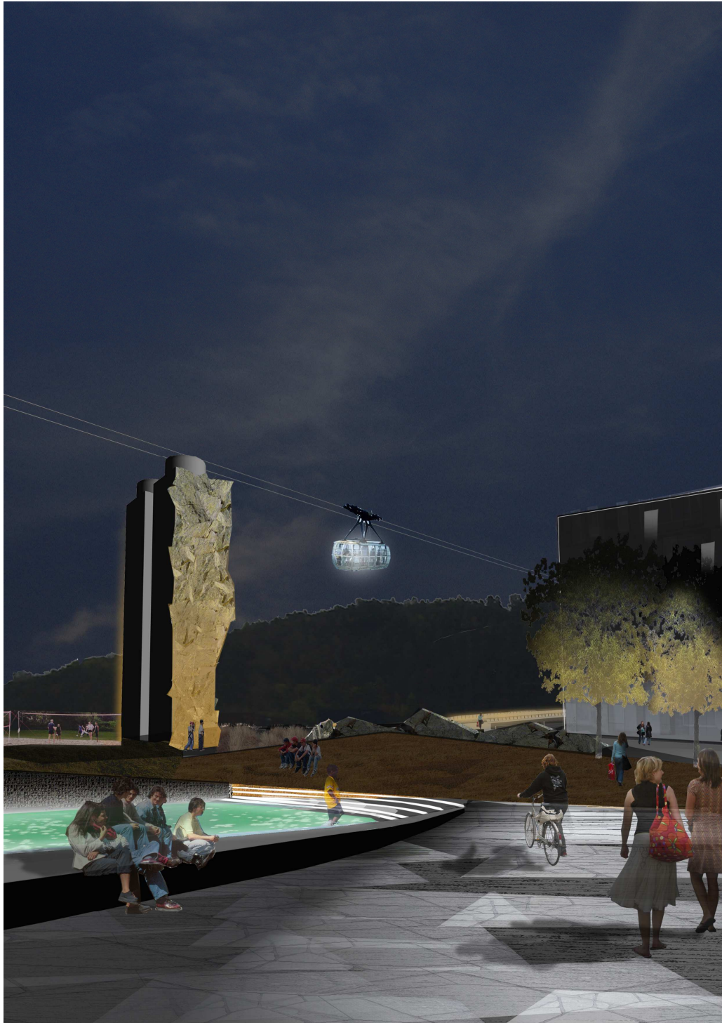
Loallmenningen, illustration by Gehl Architects, ©Bjørvika Development AS

generally based on features and factors that can be quantified and mapped. However, the approach to social aspects of the public spaces is evasive and uncommitted (2012, p.11). One could say that what the program does not explain and exemplify, the images can be telling, however, for the imagery to be more than rhetorical figures of eloquence, they would have to contain empirically based knowledge, in the same way as the written program.