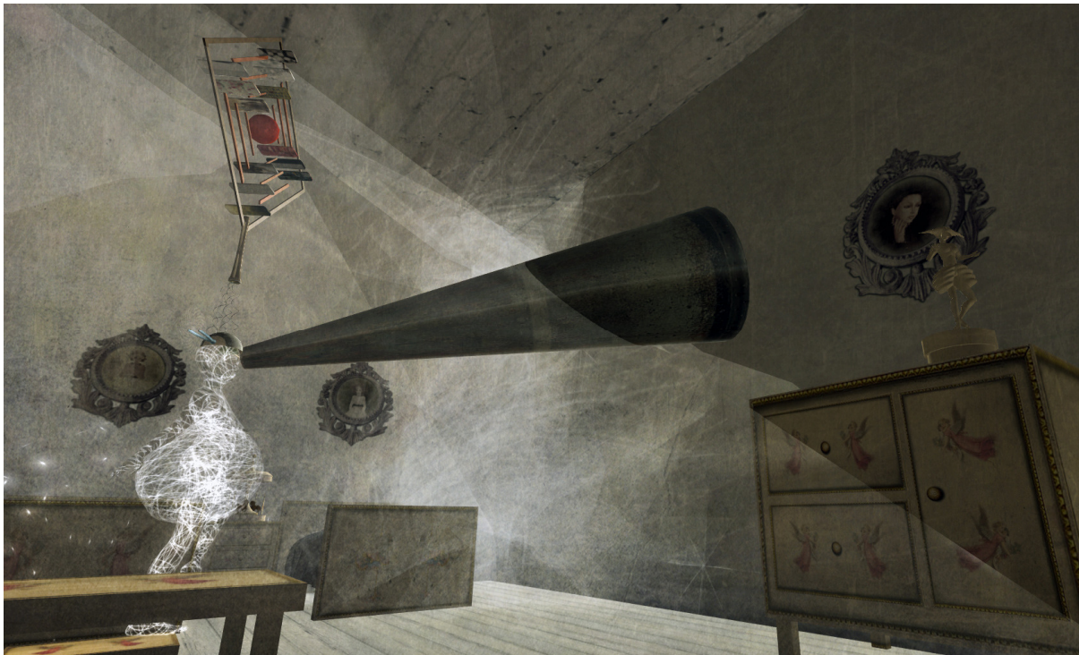
Figure 8: The Storytelling installations, Eupalinos Ugajin, 2012.

Continuous process and a floating hierarchical structure characterize produsage (Bruns & Schmidt, 2011). This implies that commercial market values cannot dominate, as Picone remarks: “Still, it is an amateur-driven, non-profit way of producing information.” (Picone, 2011, p. 101). In the Kromosomer project, roles were blurred: “We navigated between creation, procreation, and re-creation without prior agreement, as did all sorts of participants.” (Sousa & Dahlsveen, 2012, p. 430). We focused on a shared creative process and not consumption. There was no work schedule, only the absolutely unavoidable deadlines and performance times. Kairos were cultivated over chronos (Nyrmes, 2002).