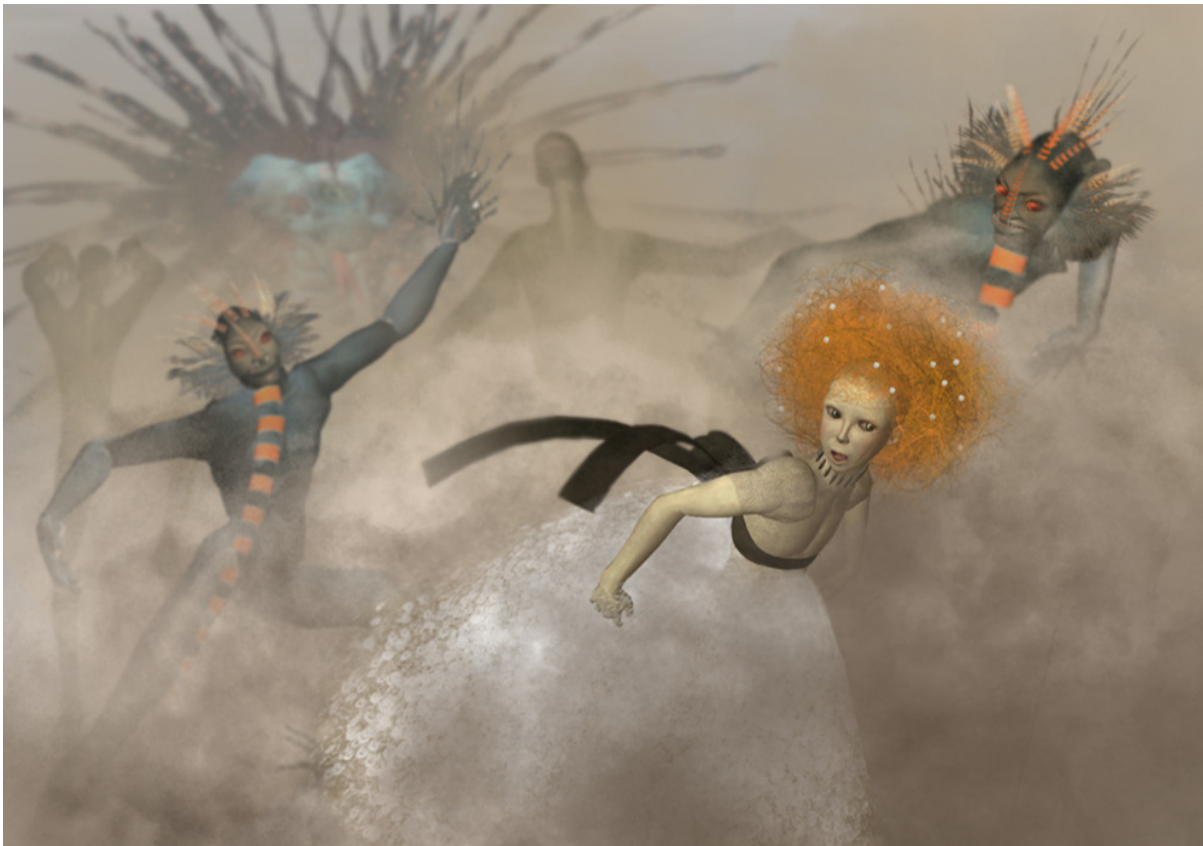
Figure 3: The Kromosomer avatars, Catarina Carneiro de Sousa aka CapCat Ragu, 2012.

In that sense the legend can be seen as an attempt to articulate the experience of meeting others. If we establish a relation between meeting a character from legends and a meeting with avatars, can this provide a tool to extend the language that can handle the sense of meaninglessness?