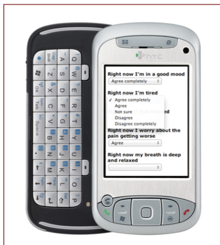
Figure 2. Smartphone screen display of diary.