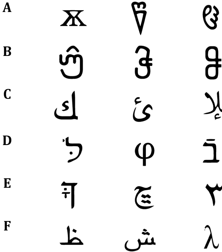
Figure 1. The stimuli A through C were used in the three 3-member class conditions, where as stimuli A through F were used in the three 6-member class conditions.

The visual stimuli consisted of letters from the Greek, Japanese, Arabic, and Cyrillic alphabets (see Figure 1).